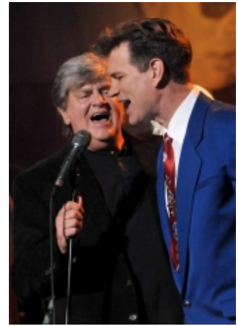
"Musicians Phil Everly and Chris Isaak perform onstage during The Listen To Me Concert Celebrating Buddy Holly held at The Music Box Theatre on September 7, 2011 in Hollywood, California"