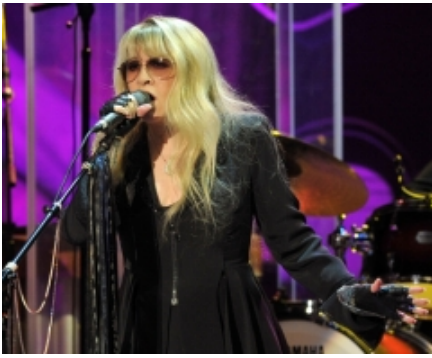
"Musician Stevie Nicks performs onstage during The Listen To Me Concert Celebrating Buddy Holly held at The Music Box Theatre on September 7, 2011 in Hollywood, California"