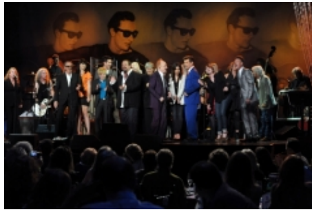
"Star-Studded Finale of The Listen To Me Concert Celebrating Buddy Holly held at The Music Box Theatre on September 7, 2011 in Hollywood, California"